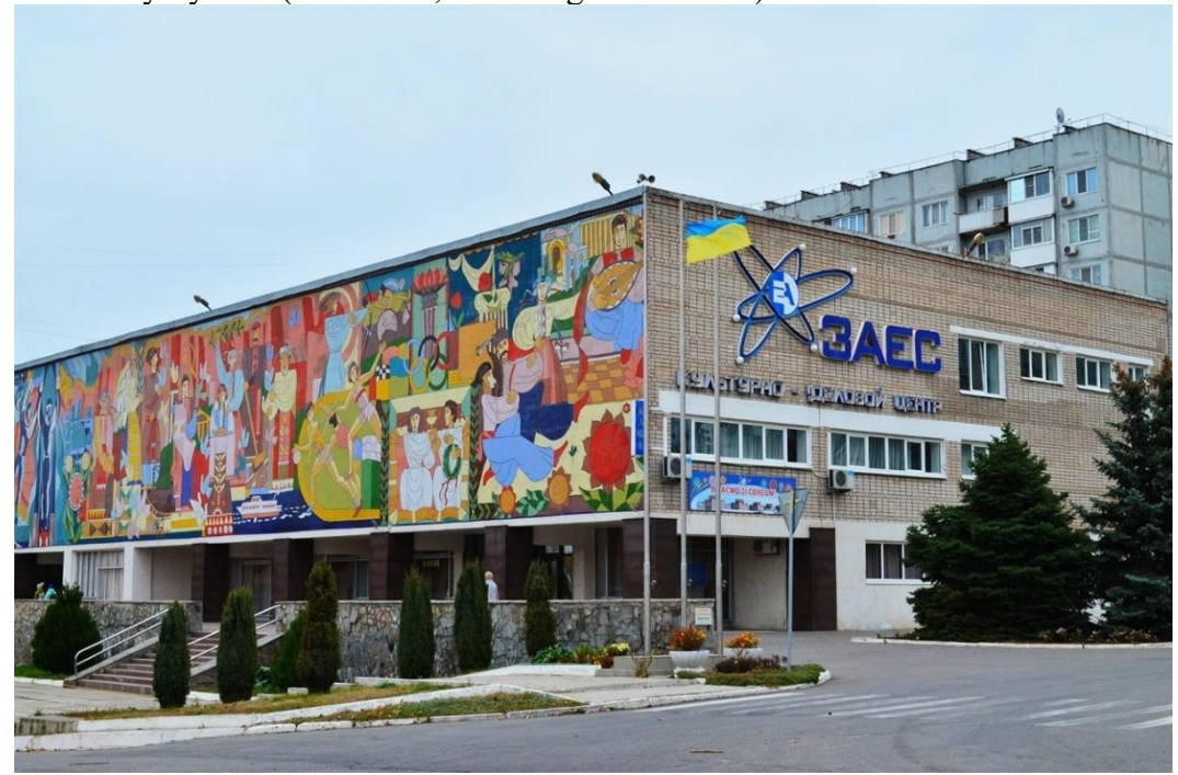
Photo: Cultural and Business Center of ZNPP

Enerhodar had a developed network of cultural institutions: City Palace of Culture "Suchasnyk," Cultural and Business Center of Zaporizhzhia NPP, a cinema, an art exhibition hall, the "ART BLOCK" gallery, and museums of Zaporizhzhia TPP and Zaporizhzhia NPP, as well as the Centralized Library System (5 libraries, including 1 children's).