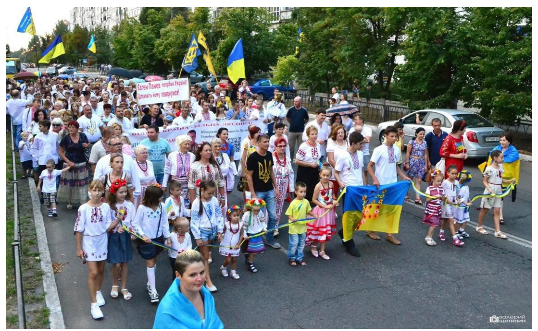
Photo: Parade of embroidered shirts "Vyshyvanka" in Enerhodar