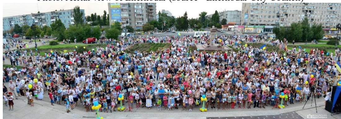
Photo: Enerhodar residents celebrating Independence Day of Ukraine in the central square (source - Enerhodar City Council)