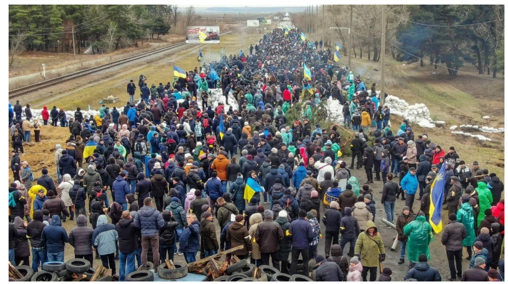
Photo: Residents of Enerhodar defending the city against occupiers

On March 1 and 2, a column of military vehicles approached the city entrance. Thousands of people, including men, women, and even children, gathered at the checkpoint with Ukrainian flags to resist the occupiers. The unexpected and active resistance forced the enemy to temporarily retreat. However, everything changed on the evening of March 3. When Russian forces once again approached the checkpoint and opened fire on the civilian population, the city residents were forced to withdraw. Approaching the Zaporizhzhia Nuclear Power Plant (ZNPP), they began shelling the station with tanks, hitting one of the blocks and the training center, starting a fire. Throughout this time, online cameras on the station's premises allowed the world to witness live the military capture of the nuclear plant, violating all international norms.